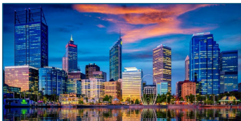
(Perth City, Western Australia)

In delivering the 2023 ICF Canoe Ocean Racing World Championships we are committed to engaging, inspiring and motivating a generation of paddlers with a world class event that highlights our renowned Western Coastline and diverse paddling community.