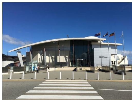
(WA Maritime Museum, located also in Fremantle)

The race will finish at Scarborough beach. Scarborough beach is another beloved Perth beach. The beach itself has a long stretch of white sand and regular surf breaks, offering opportunity for competitors to test their skills in timing their entry to shore. There are many cafés, bars, restaurants and shops and a large range of accommodation from backpacker hostels, affordable family apartments to luxury hotels with ocean views, ensuring accommodation options for all competitors are available. Scarborough beach will also be used to establish an event hub which will undoubtedly facilitate a festive and community energy. Scarborough Beach is a 20-minute drive northwest of Perth and regular buses run from the city. Given the popularity of both the start and finish locations, this will offer organisers the opportunity to bring the sport to an entirely new audience, creating both spectator and media interest.