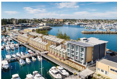
(Fremantle, Western Australia)