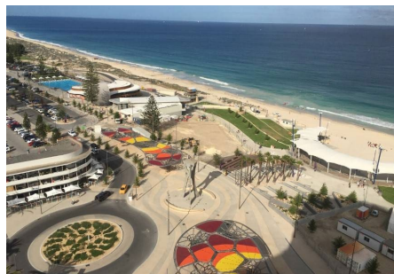
(Scarborough Beach Promenade)

The course is a downwind race stretching 20km up the coast of Perth, starting in Bathers Beach, Fremantle finishing on shore at Scarborough Beach. Paddlers will start the race by paddling out to sea for 1.8km and then turning north, paddling past the Fremantle Port. The course has been designed to not only start and finish in iconic locations but also to align almost perfectly with the Fremantle Doctor breeze which blows every day in summer from a south-west to south-south-west direction.