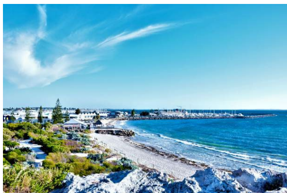
(Bathers Beach, Fremantle)

Fremantle Fishing Boat Harbor has been a fully operational fishing port since the early 1900s, today the harbor precinct also features boardwalks, cafes, restaurants and a brewery. Tucked between the WA Maritime Museum and Fishing Boat Harbor is Bathers Beach. Bathers Beach is where the rich heritage and vibrancy of Fremantle meets the ocean. It's here you'll find bars, cafes and restaurants and the oldest public building in Western Australia.