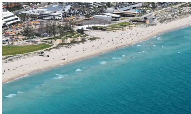
(Scarborough Beach, Western Australia)